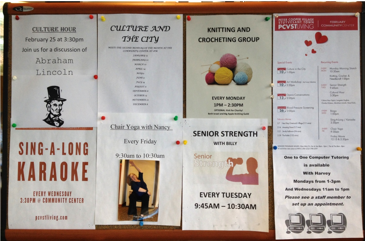
A community bulletin board

We now communicate in ways few could have imagined a decade ago. Age-friendly communities recognize that information needs to be shared through a variety of methods since not everyone is tech-savvy, and not everyone has a smartphone or home-based access to the internet.