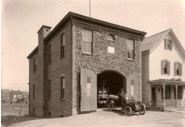
Relief Hose Co. 3, Haverstraw FD